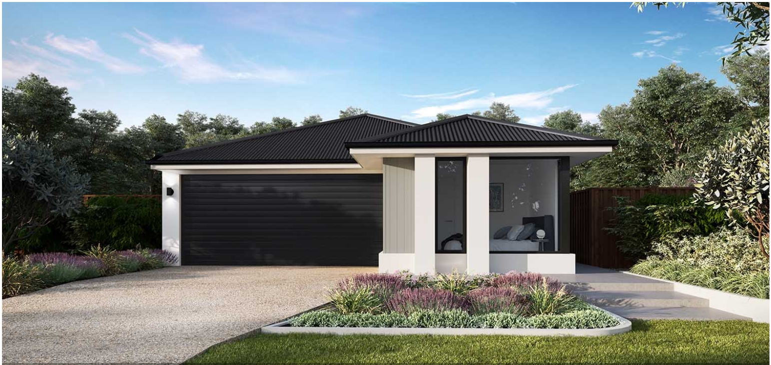
Facade image may depict features such as landscaping, timber decking, furniture, window treatments and lighting which are not included in the package price. Image is for illustrative purposes only.