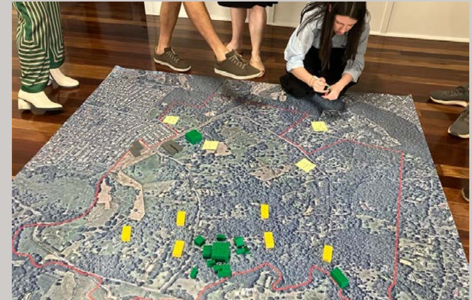
Images from the workshop sessions.

WHAT WE LOVE: VIEWS + LANDSCAPE SETTING. WILDLIFE. GREEN 'BREAK'. SURROUNDING SERVICES. - SPACE. LOCAL FACILITIES. NO TRAFFIC LIGHTS. PEACE + QUIET. FREEDOM, SPACE, GREEN. GREAT COMMUNITY. FOOTPATHS PRECIOUS GREEN ZONE. IMPROVEMENTS. MORE TRANSPORT OPTIONS. CAR PARKING AT TRANSPORT HUBS. (RAIL PARKING) - BETTER FLOOD MITIGATION - BAD FLOOD ISSUES. (IMPACTS OF DEVELOPMENT) CONCENTRATION OF WATER. CHANNELS. BETTER (CO-ORDINATED) PLANNING. MORE BUSES. UPGRADES IN ADVANCE. - ADDRESS SPEED. (TRAFFIC RESTRICTS ACCESS TO SERVICES)